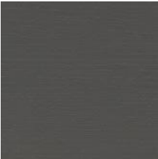
MGR - VEINED GREY