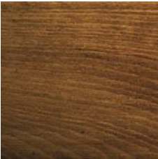
MNO - WALNUT